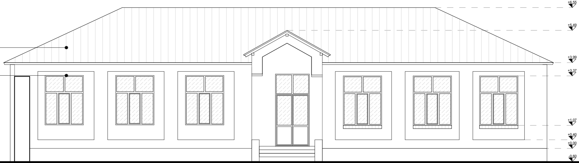
EXISTENT CORP C1 - FATADA VEST